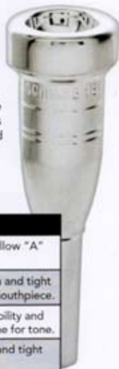
Heavyweight Trumpet Mouthpiece Descriptions

A "Heavyweight" profile trumpet mouthpiece option is available in the following best selling rim sizes only. The additional mass provides a darker focused sound, with more secure slotting and increased projection at louder dynamic levels.